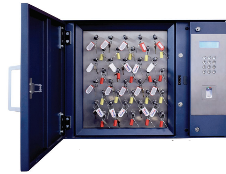
Remove key. Access peg cannot be removed until the key is returned.