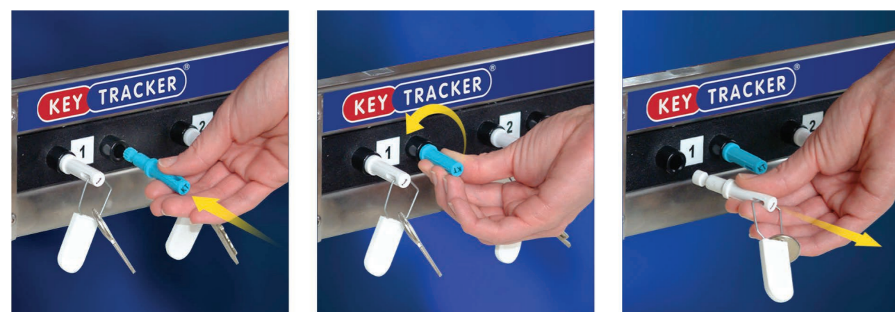
Insert your personal colour coded access peg...